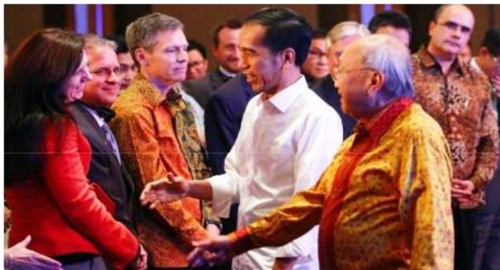
Calon presiden terpilih dalam Pilpres 2014 Joko Widodo (kedua kanan), dengan didampingi Ketua Umum Apindo Sofjan Wanandi, menyapa sejumlah pengusaha saat menghadiri Peluncuran Buku Roadmap Perekonomian Apindo di Jakarta, Kamis (18/9/2014).

Jadi Presiden, Jokowi Tetap Siap Terjun ke Lapangan demi Bebaskan Tanah