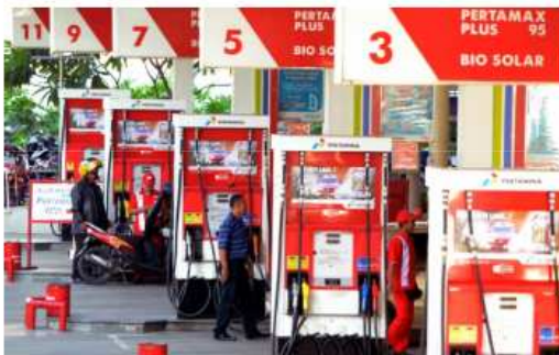
Apindo Dukung Pemerintah Naikan Harga BBM

JAKARTA - Hari ini Asosiasi Pengusaha Indonesia (Apindo) mengadakan launching roadmap perekonomian yang disusun sejak Maret hingga Agustus 2014. Roadmap ini diterima langsung oleh Presiden dan Wakil Presiden (Wapres) Terpilih 2014-2019.